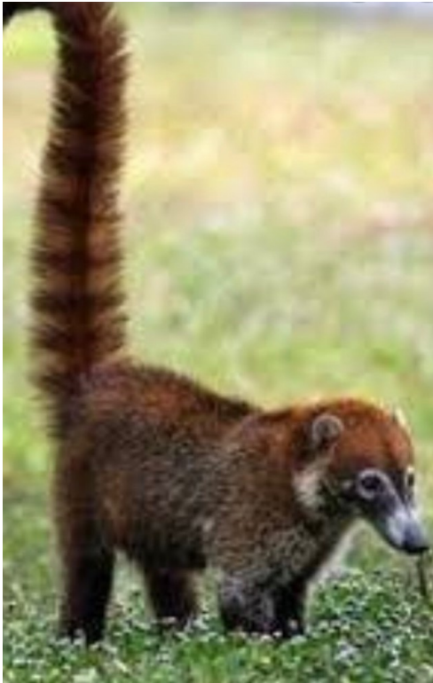
Lana's oldest son encountered this coatmundi on a visit to New Mexico. Very aggressive creatures.