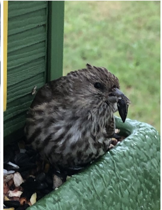
Sparrows eating at feeders— Lana's House